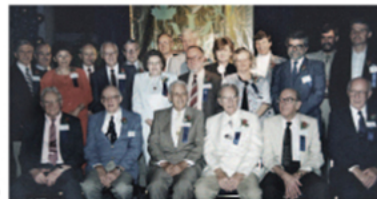
CPA Past Presidents, 50th Anniversary celebration, Halifax, 1989