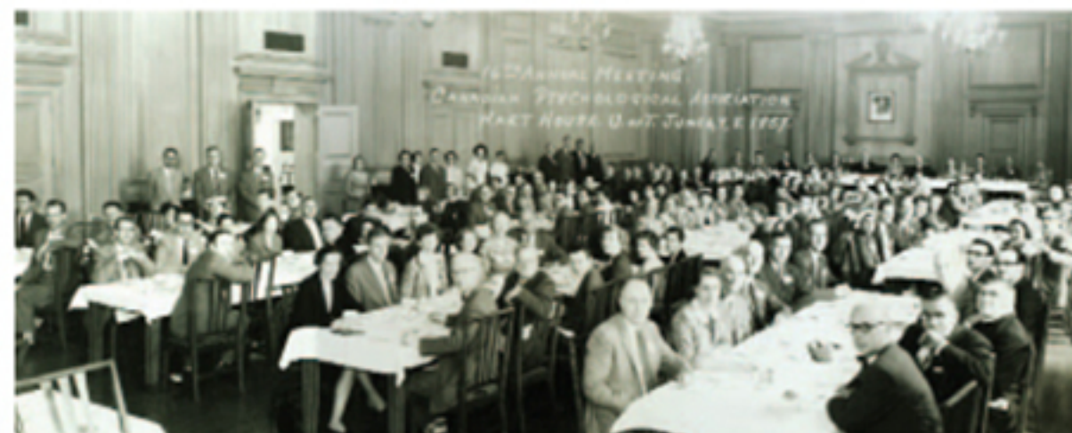
16th Annual Meeting of the CPA, Hart House, University of Toronto, June, 1957

Almost 500 pages and with many photographs from the archives, A Chronicle documents milestones in CPA's history, including early attempts in the 1940s to establish pan-Canadian certification, the Opinicon and Couchiching conferences of the 1960s, the tremendous growth of Canadian psychology in the 1960s and 1970s, the Status of Women in Canadian psychology, The Code of Ethics in the 1980s, Accreditation of professional training programmes in the 1980s, the growth of CPA's Sections in recent decades, and enhanced advocacy efforts for science and practice from the 1990s to today. Brief Biographical Notes on over 300 Canadian psychologists are included.